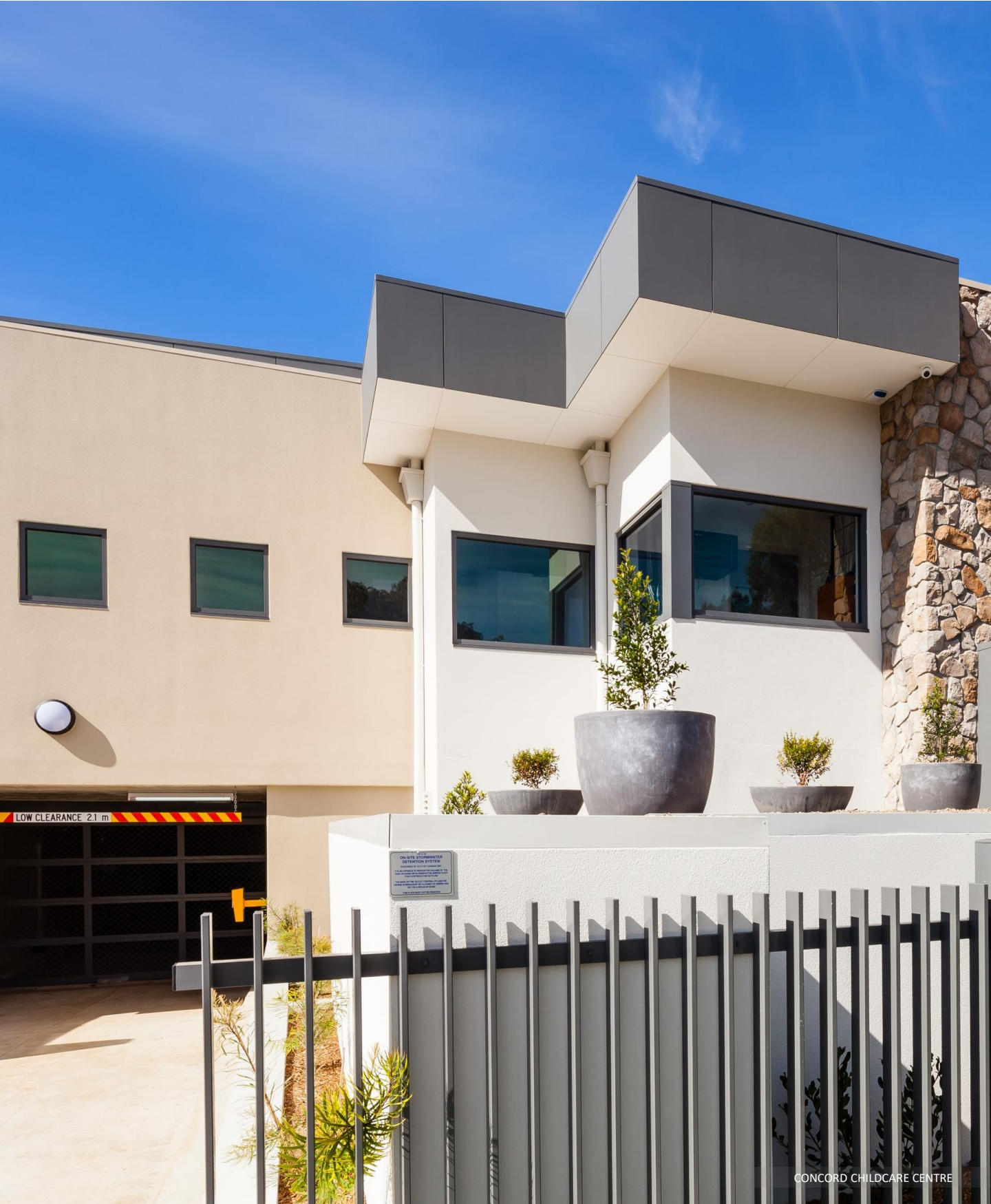
CONCORD CHILDCARE CENTRE

Thank you considering CCS for your exciting Childcare Centre project